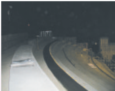
Theatre - tiered seating